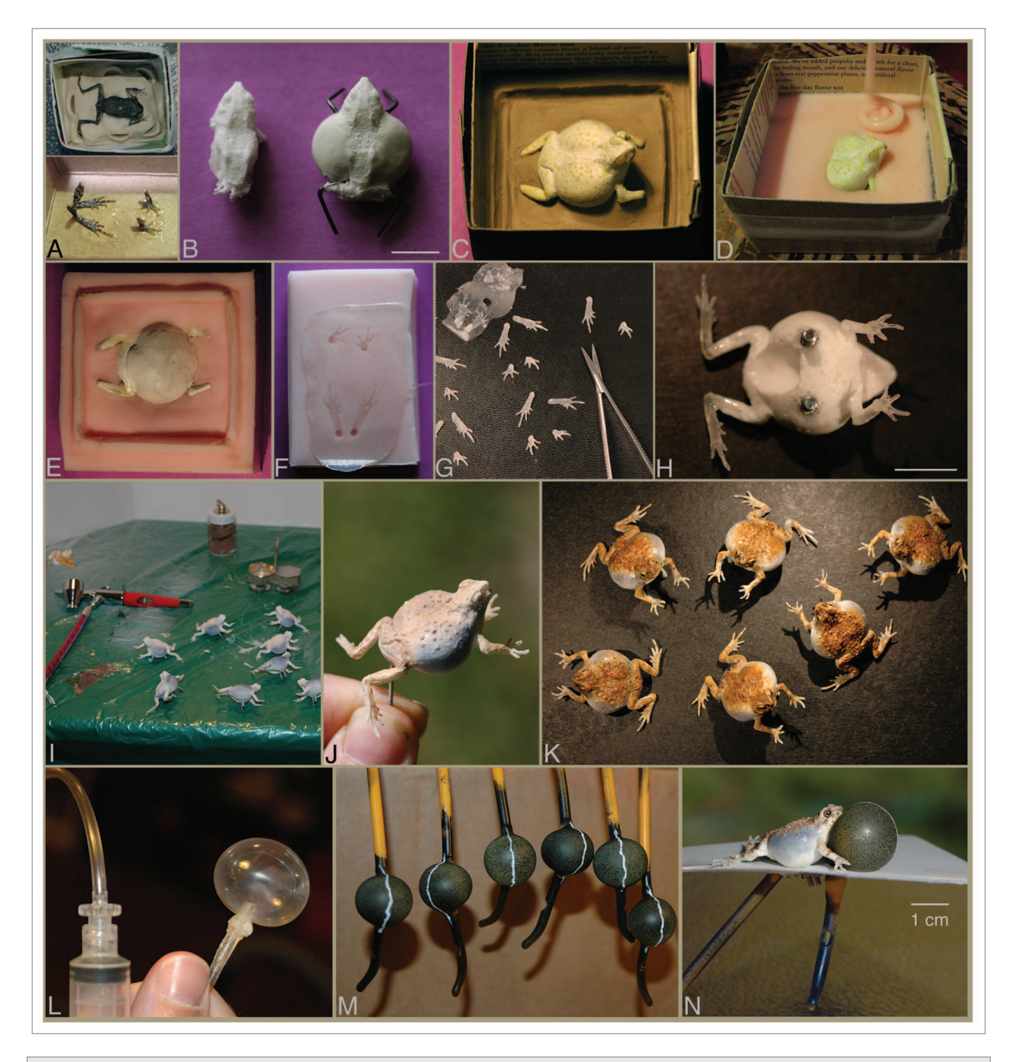
Figure 1. For figure legend, see page 4.

the model of the frog's body accompanies these stimuli.<sup>52</sup> Is the inflating artificial vocal sac sufficiently alluring and did we needlessly surpass this threshold of visual stimulation when creating realistic models to accompany the vocal sacs ( Fig. 1L , M and N )? When túngara male frogs court, the vocalization is the dominant signal component, but females respond significantly more when the call is accompanied by an inflating artificial vocal sac,<sup>52,54</sup> and when both the call and the vocal sac